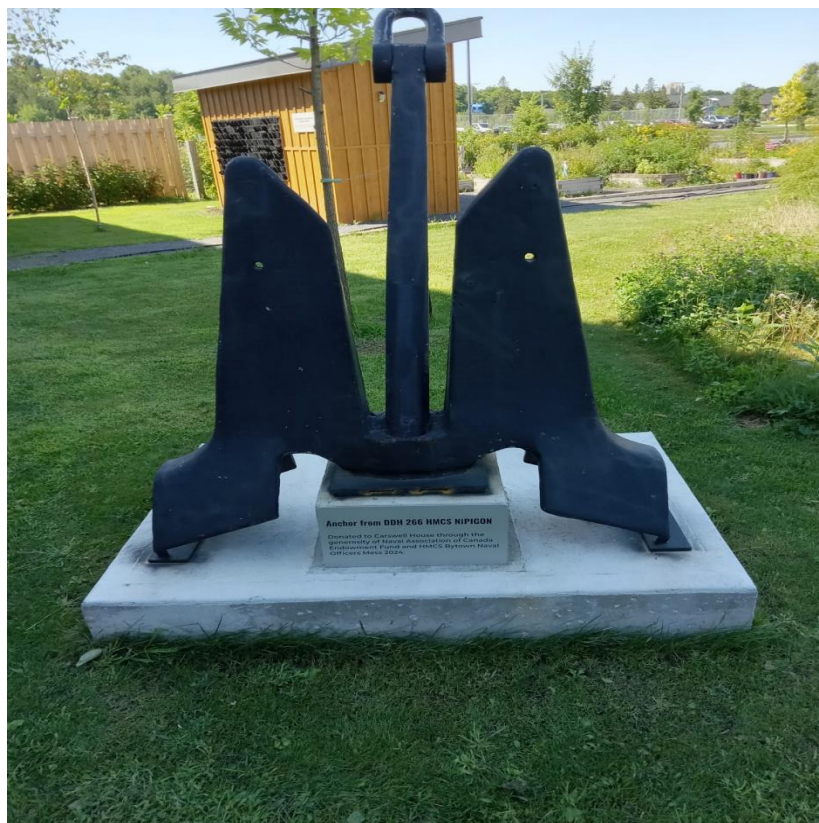
HMCS NIPIGON anchor now in place at Carswell Veterans' House, Ottawa ON with NACEF support

PO Box 42025 Oak Bay 2200 Oak Bay Avenue, Victoria, BC, V8R 6T4