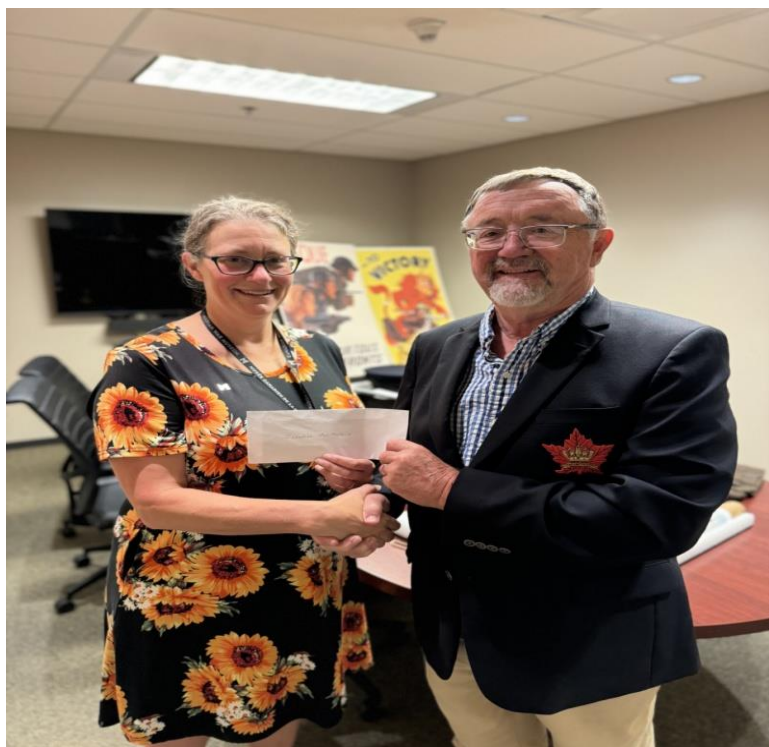
Presentation of NACEF Cheque to the Canadian War Museum

PO Box 42025 Oak Bay 2200 Oak Bay Avenue, Victoria, BC, V8R 6T4