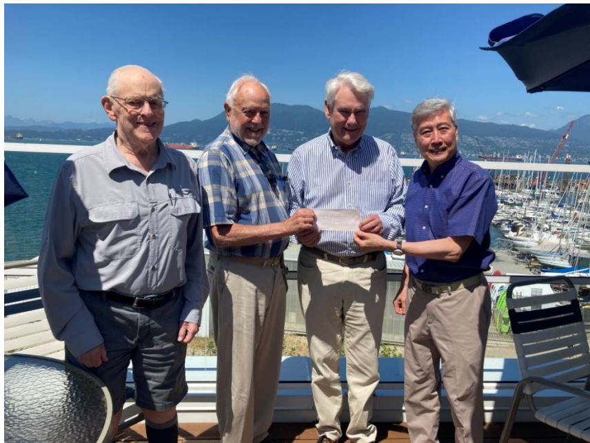
Presentation of NACEF cheque to the Metro Vancouver Naval Monument Society for Shipbuilding Monument.

PO Box 42025 Oak Bay 2200 Oak Bay Avenue, Victoria, BC, V8R 6T4