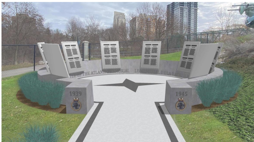
Artist's impression of the Battle of the Atlantic Memorial Wall of Honour project at HMSC PREVOST, supported by NACEF

PO Box 42025 Oak Bay 2200 Oak Bay Avenue, Victoria, BC, V8R 6T4