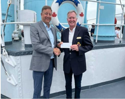
Presentation of NAC EF cheque for HMCS Sackville