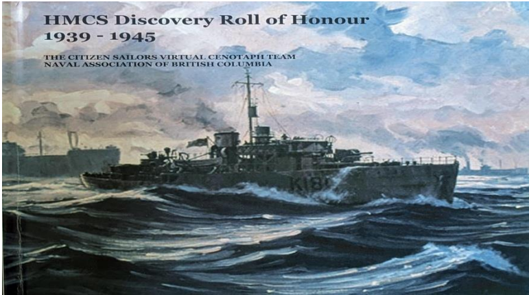
NACBC project completed in 2023